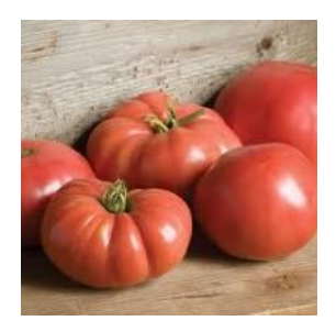
BONNIE BEST classic medium sized slicer and canner. Superb flavor!

GERMAN JOHNSON Gorgeous pink heirloom replacing two of my previous favourites, (damsel and brandywine) more vigorous and higher yields although not quite as early as damsel, it is earlier than Brandywine.