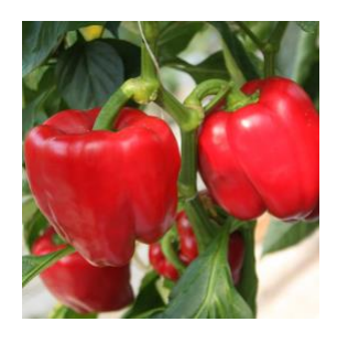
ACE Turning red right on the heels of olly, Ace proves time and again its reliability

OLLY Earliest red pepper I have ever grown. Almost guaranteed an abundant harvest of red ripe peppers. Excellent in containers!