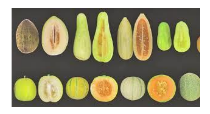
WATERMELON BY PRE ORDER ONLY-curently trialing -Limited-Heirloom and Hybrids available, yellow, pink and red flesh.